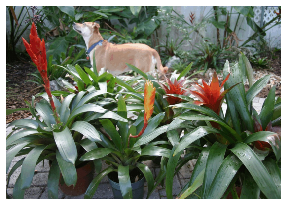
Lynne's Precious Dog with Precious Guzmania

Single/Double $89.00 until September 14, 2007 Speaker: Chester Skotak , bromeliad hybrids (his ace subject)