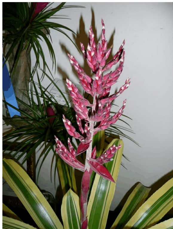
Identify this albomarginated plant. Why, you may ask. It is a test of your skills and your interest (are you reading this advisory?) Anyone with an answer merely needs to state such at the meeting and win a prize.