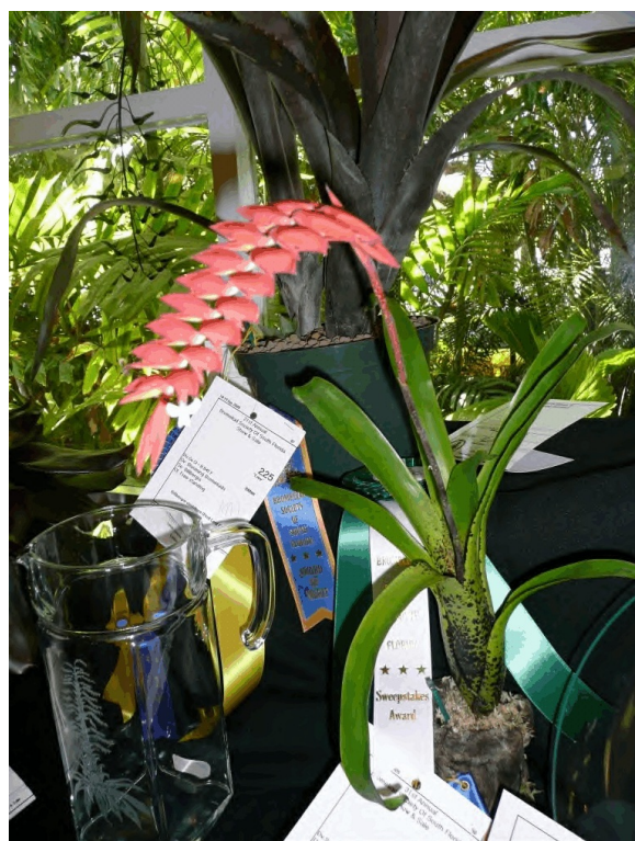
Tillandsia dyeriana