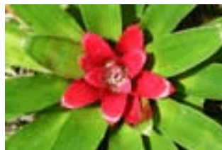
Nidularium rutilans

“Great contrast, especially with the unique inflorescence of the fraseri and its daisy like top — I don’t know if there is a mix, but if the mix brings the great striping of fosteriana with the inflorescence of fraseri , I would venture to guess that you might be able to receive as much as $75 the first year and $45 to $55 the years thereafter.”