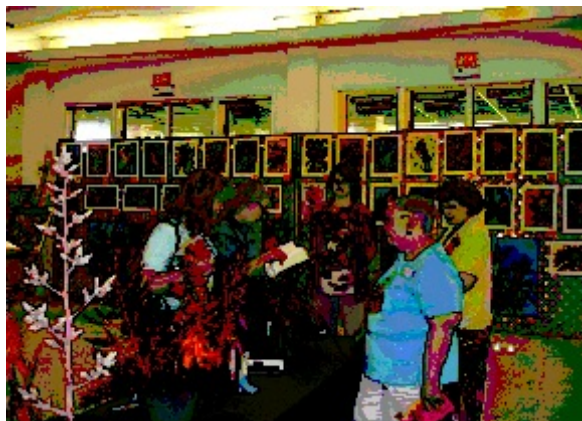
Judges reviewing entries