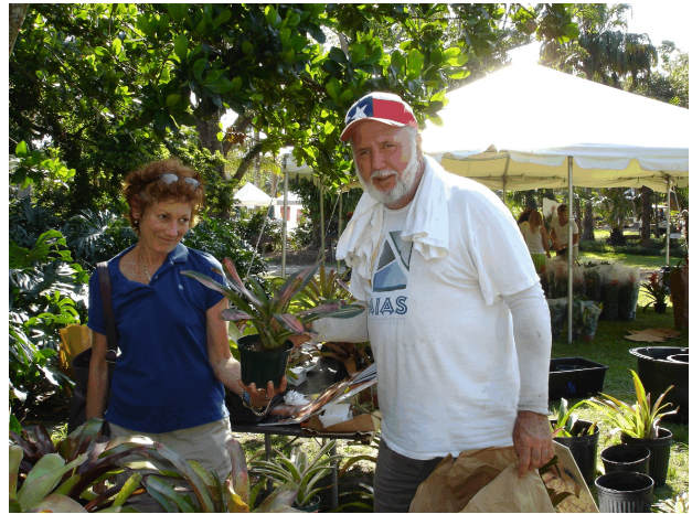
Mike Makes a Sale and a Friend