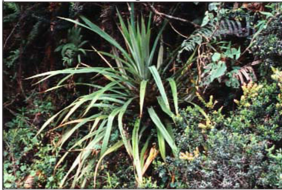
Greigia columbiane dichroantha