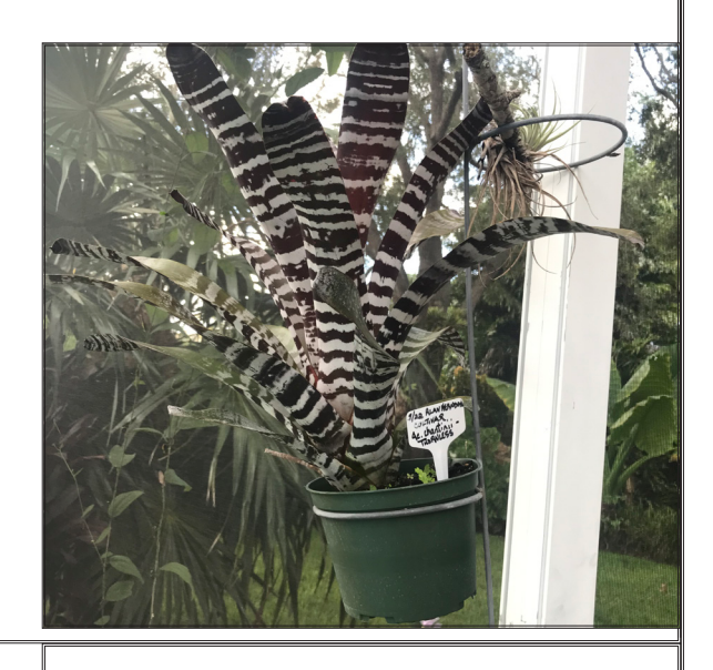
Alan's thornless cultivar