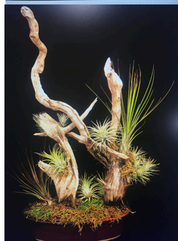
1. Tennis Racket to Pineapple 2. Dancing Tiger 3. Tickling Tillandsia. All entries by Josefa Leon.