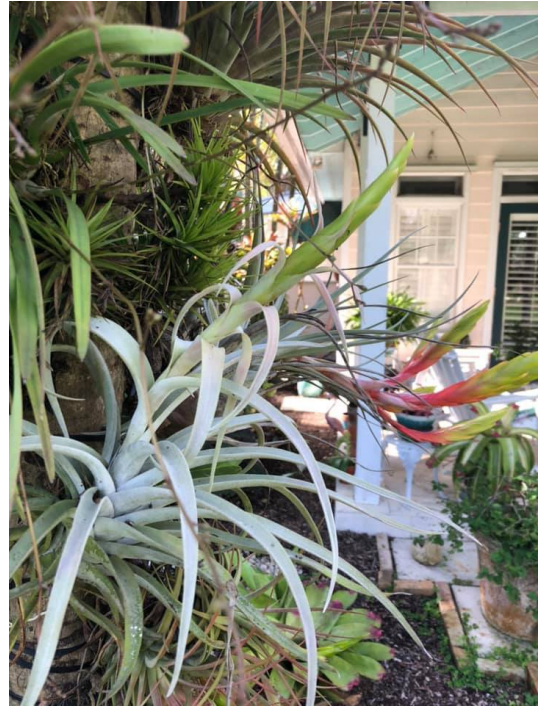
Lori Weyrick Tree