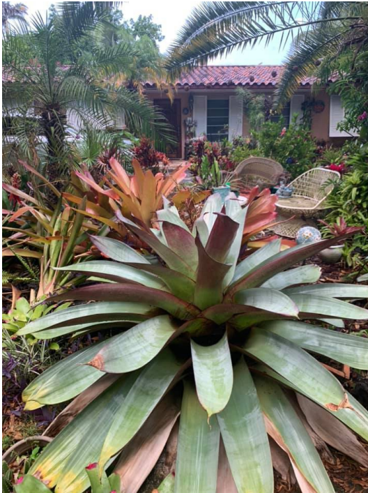
Tina Katsaras yard.

Our page has over 1,100 members, and our group page has over 2,700 followers. Between the two facebook pages, we see some pretty gardens. Here are some examples.