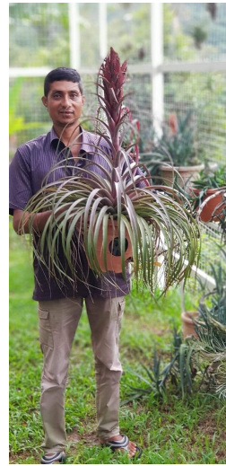
Capitata Red x Jalisco Monticola