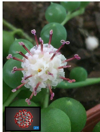
Senecio rowleyanus “String of Pearls”