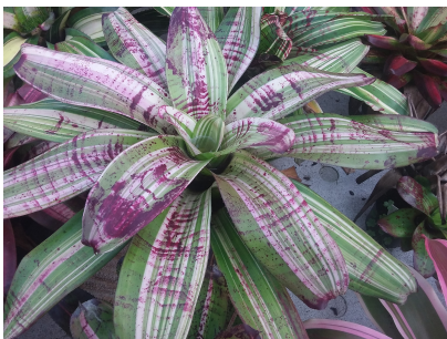
Neo. Mad Max

This too will have to wait for the “ALL IS CLEAR” signal.