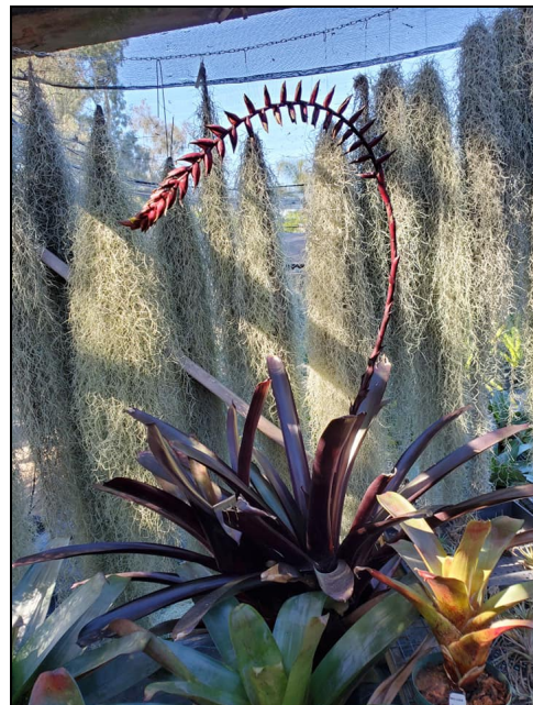
Bird Rock Tropicals