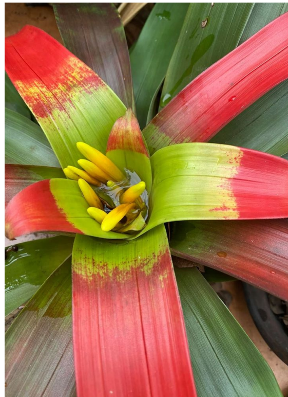
Guzmania Sanguinea

https://www.bsi.org/new/world-bromeliad-conference-registration/ 1/31/2020 Deadline for EARLY registration reduced fee