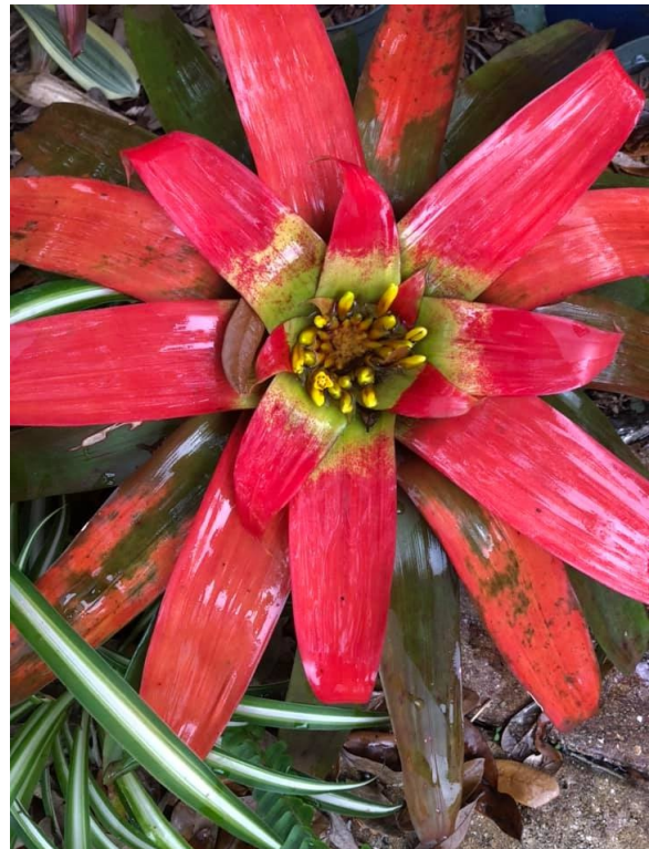
Guzmania Cousin ITT

Cheap Prices Good Cause Contact any board member.