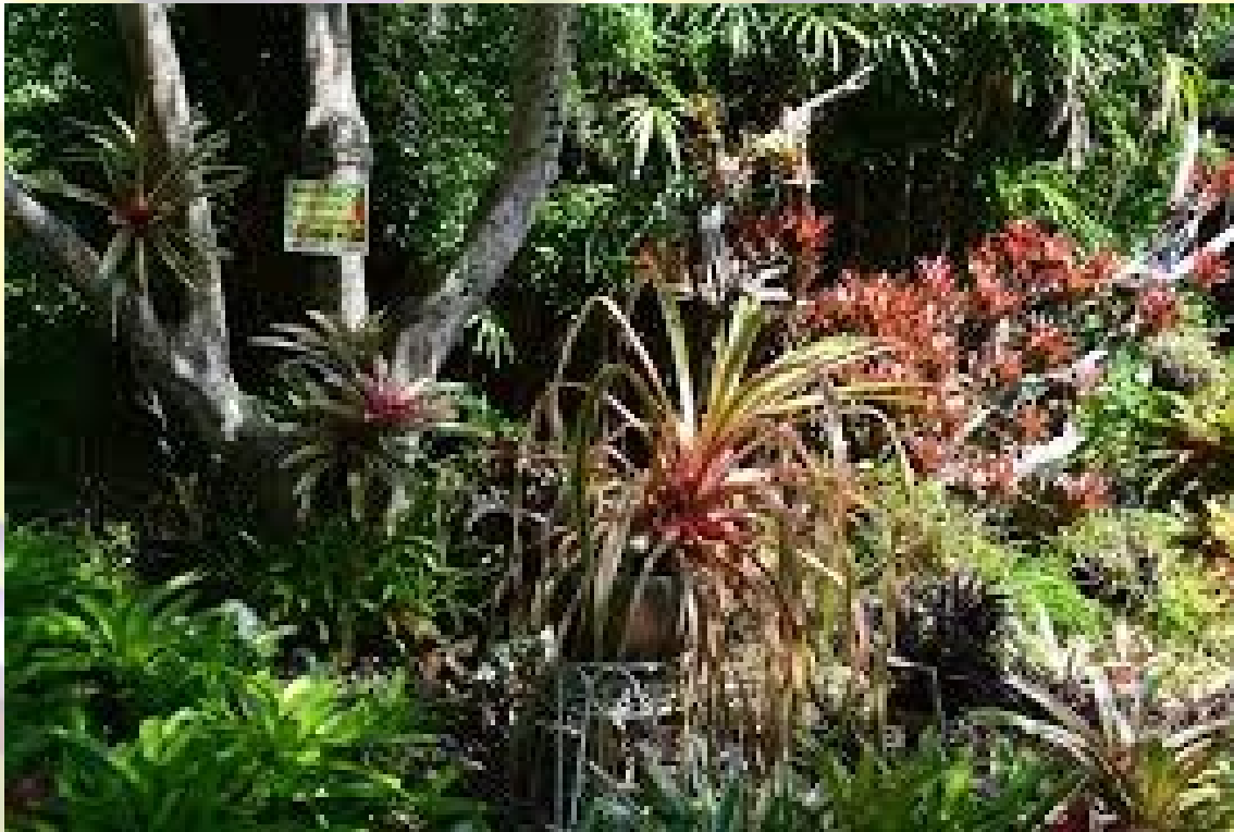
Eileen Hart's yard