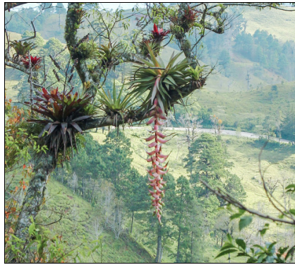
Shot of an eco tour vista as displayed on Bird Rock Tropicals web page