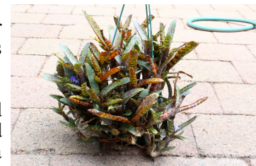
Miniature neos in a pot

A few of the larger Neoregelia species - including N. compacta , N. macwilliamsii and the closely related cultivar N. 'Bossa Nova' - also bloom naturally