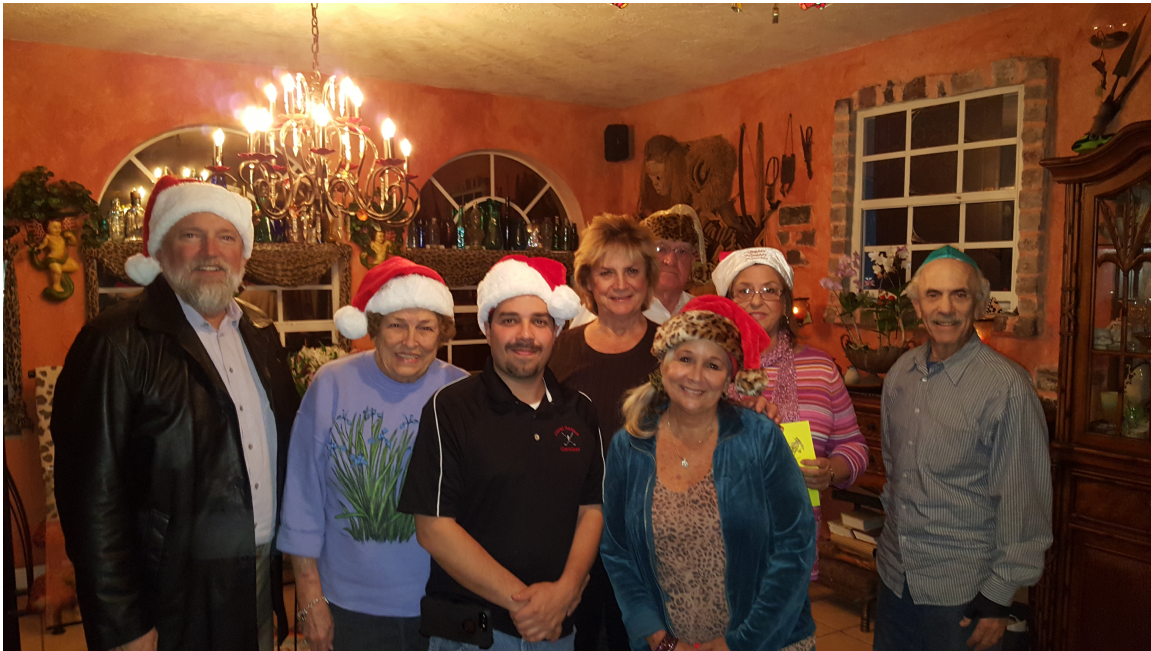
Happy Holidays from the Board