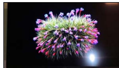
showing off brilliant plants.