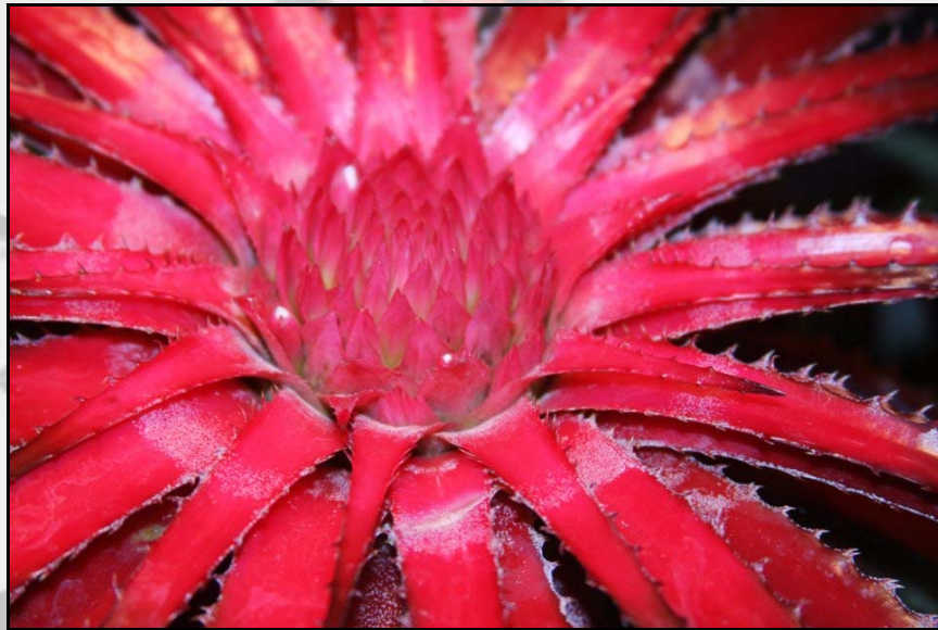
Orthophytum roseum