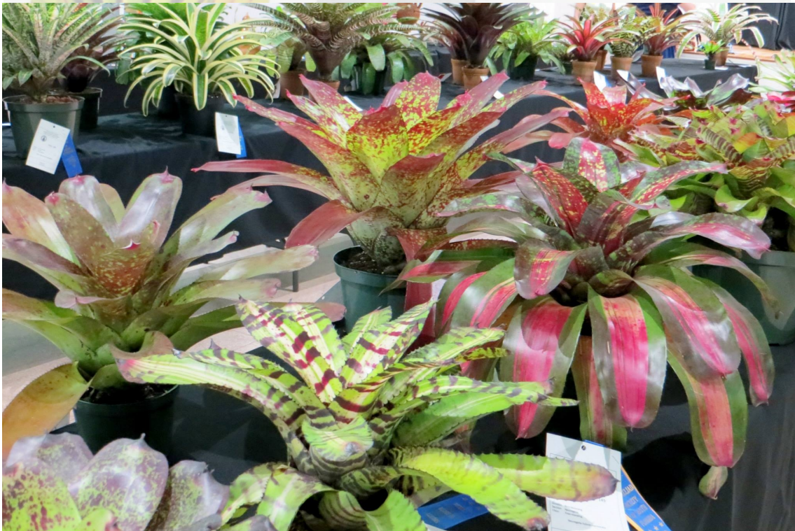
2014 Show Entries