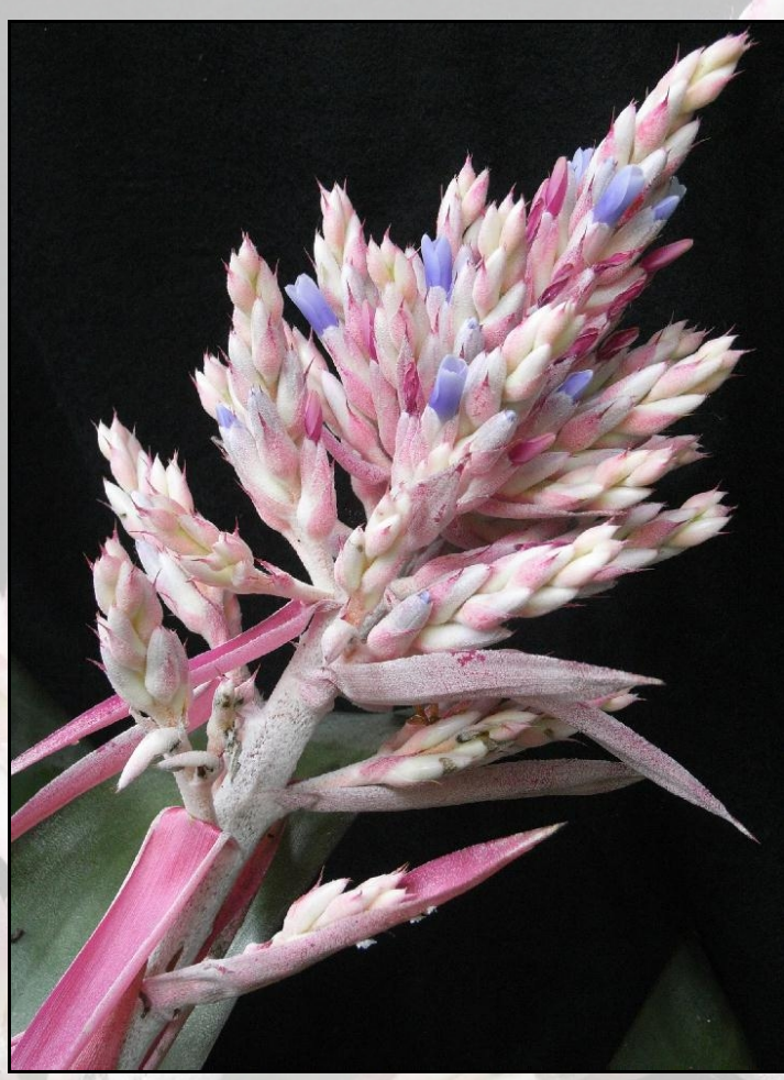
Aechmea 'Eileen' US PP7833 P, patented by Nat DeLeon June 22, 1990.