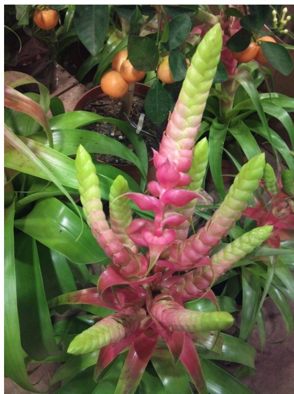
Photo from New Covent Garden Market