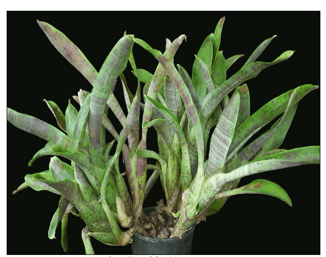
Neoregelia guttata aka 'Freckles'

single plant o f Neoregelia indecora was also found in full flower towards the end of the month. Finally, two of the miniature Neoregelia species: Neoregelia ampullacea Neoregelia punctatissima (red leaf form) continued their habit of blooming whenever a pup reached appropriate size.